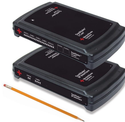
12-zone SunDialer ® I-Con ® with sensor ports and SunDialer IP Interface