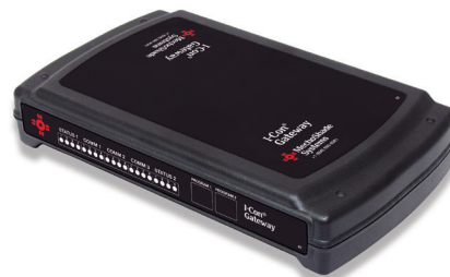
I-Con ® Gateway internal control

May be ganged for additional zones—up to four units for 48 zones