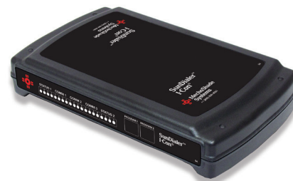
12-zone SunDialer I-Con without sensor ports

May be ganged for additional zones—up to four units for 48 zones